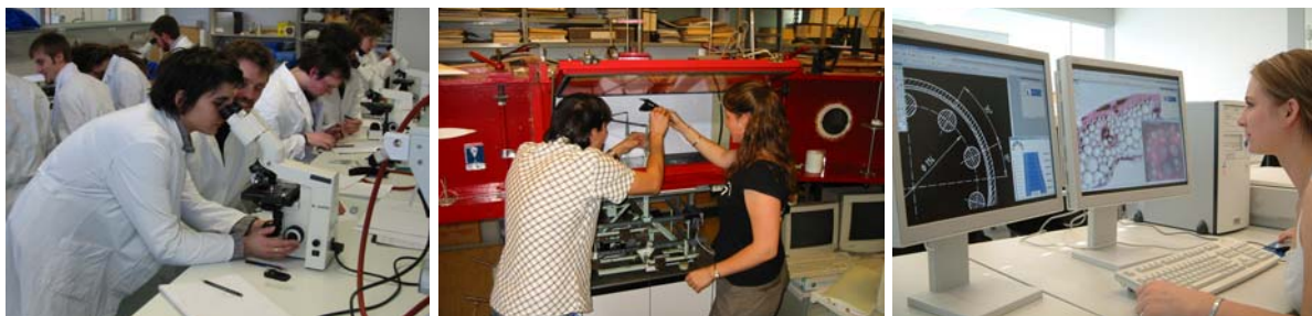
Students at work: Microscopy, Wind tunnel experiments and CAD Lab are integral parts of the course

The international degree in Bionik (Biomimetics) (B.Sc.) is an interdisciplinary, practical and application-oriented course with a standard study period of study of 7 semesters, including one semester abroad. The module structure of the course and the implementation of the ECT-System guarantees recognition within the international education system. The lectures’ scheme is divided into different scientific areas: During the first semesters fundamentals in science like physics, chemistry, mathematics, biology and some engineering topics form the basis of the course. Semesters 4-7 not only consolidate this knowledge but also provide an in-depth insight into chosen main topics in the area of materials, construction, and transport systems (locomotion). Alongside scientific-oriented teaching a great emphasis also lies on cognitive and soft skills. Lectures and seminars further incorporate from areas such as management, communication, journalism as well as foreign languages as an integral part of the programme.